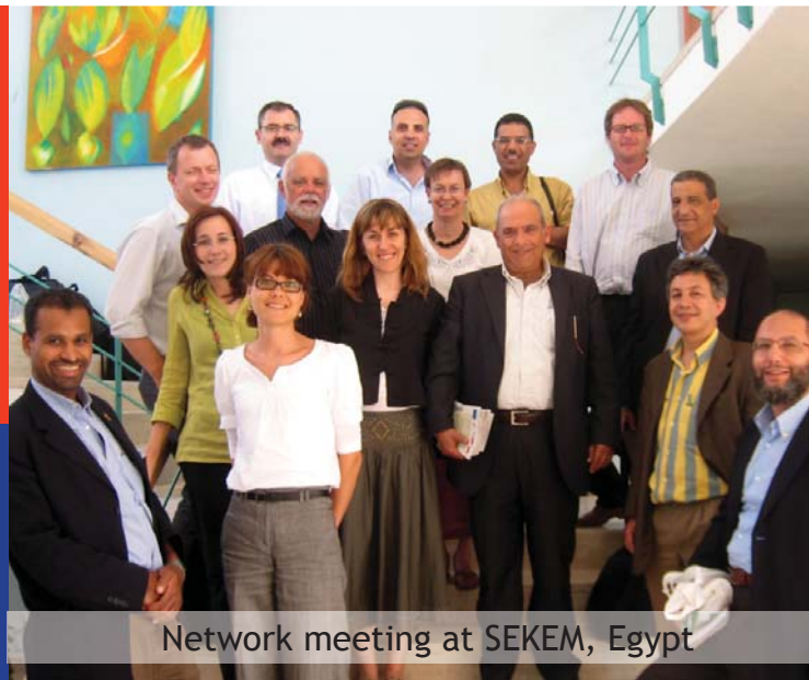
Network meeting at SEKEM, Egypt

Get in touch with young talents and potential future employees