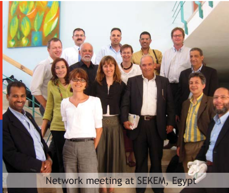
Network meeting at SEKEM, Egypt

Get involved in a university- industry network and build long-term strategic alliances